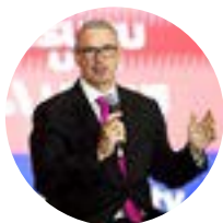
The Hon Stephen Conroy (Chair)